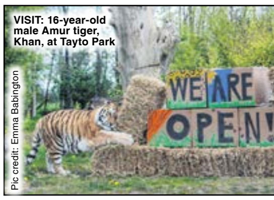
VISIT: 16-year-old male Amur tiger, Khan, at Tayto Park

co.uk 4 star The Captains Cottage, Cushendall, Ballymena, Co. Antrim The Captains Self Catering Cottage is a quaint but traditional-style cottage situated in a quiet location in Cushendall. This holiday home features a garden, BBQ facilities and free private parking as well as a fully equipped kitchen and large living area. This unique cottage features two bedrooms – one double (ensuite) and one twin that converts to a king size. Only a few minutes' walk to the beach and village, this stay is perfect for a short family trip. ● See discovernorthernireland.com/accommodation/the-captains-cottage-p725171