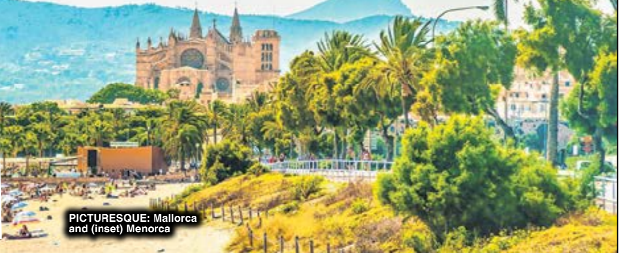
PICTURESQUE: Mallorca and (inset) Menorca

DUE to travel being off cards for much of the past year, which has delayed many planned hotel openings, 2021 is set to be jampacked with hotel debuts in the Balearic Islands.