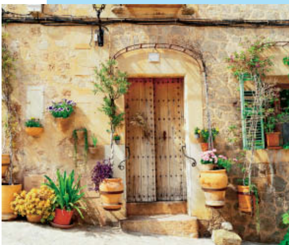
Valldemossa is bloomin' lovely

They're two of the most popular destinations for beauty, beats and beach vibes – but will you choose Mallorca or Ibiza?