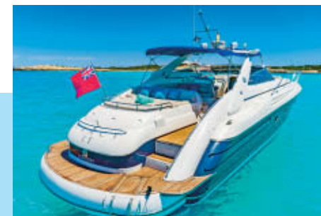
Seas the day on a Fancy Boat

When travelling with little ones, a villa is often an easier choice than a hotel. The four-bedroom Casa Panorama has a huge pool, spacious cabanas for shade, a giant BBQ and alfresco dining area. Stay for £45.50 per person per night (Vrbo.com). Give yourself the five-star treatment by booking an