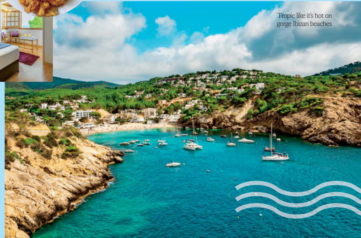
Tropic like it's hot on gorge Ibizan beaches

The White Isle truly is a playground for adults and kids alike, and the family-friendly beach bar at Hotel Riomar in Santa Eulalia is as good as it gets. The golden sands here are buggy-accessible and smoke-free, there are plenty of shady areas, plus there's a lifeguard on duty. Grab a daybed and make a day of it. Dinner at the hotel's Ocean Brasserie overlooks the crashing waves, and has a top-notch kids' menu and highchairs. Blake tucked into fresh hake and fries, £8.50, while we slurped oysters, £20 for 12, and crispy calamari with limo mayo, £17 (Hotelriomar.com). F